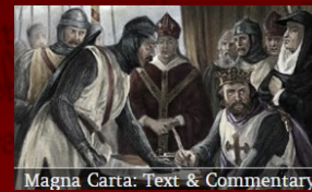
Magna Carta: Text & Commentary