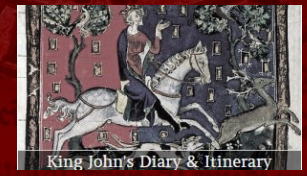
King John's Diary & Itinerary