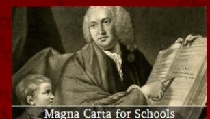
Magna Carta for Schools