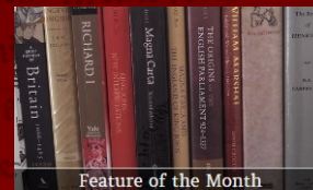
Feature of the Month